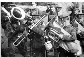
Dashing White Sergeant - quick march of the Royal Berkshire infantry Regiment 1914