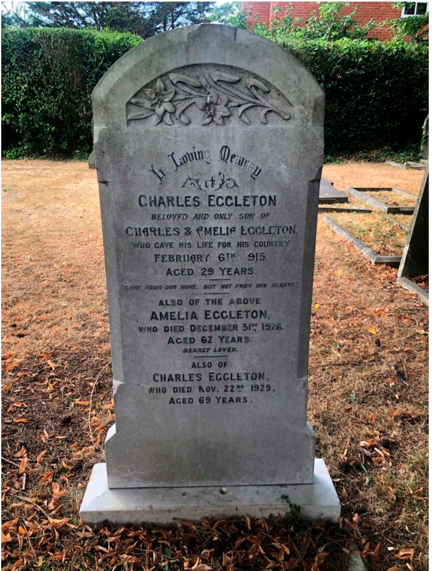
Bray Cemetery, Windsor Road