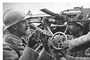
First Battle of Ypres