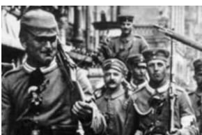
First Battle of the Marne