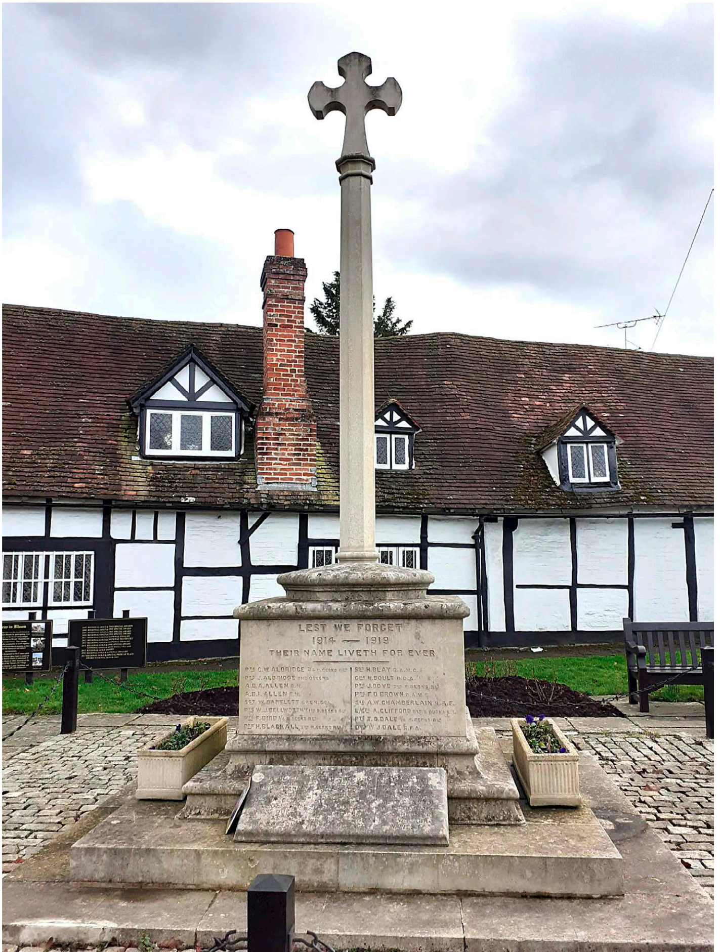
Bray Memorial stone