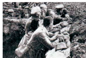
First Battle of the Aisne