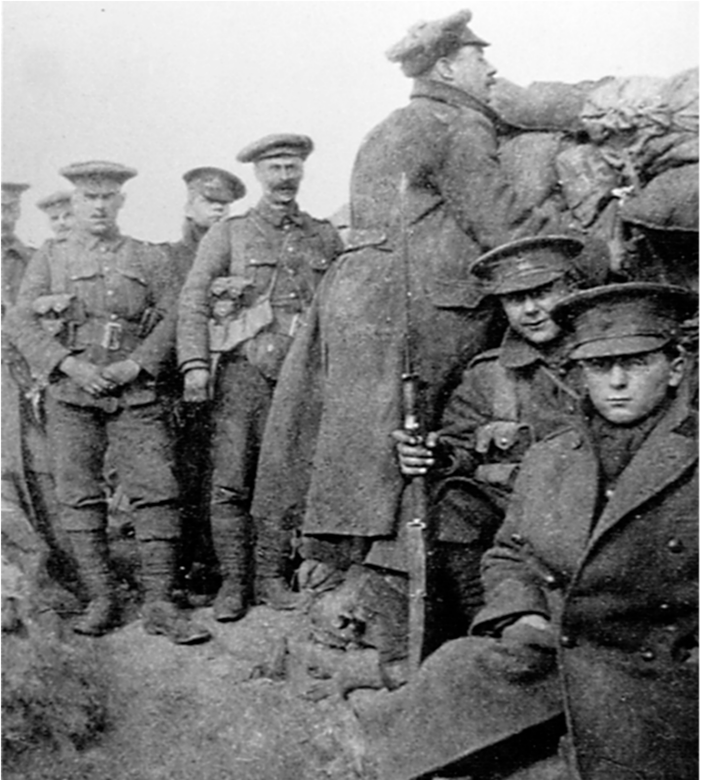
The Royal Berkshire Regiment in the trenches, 1914